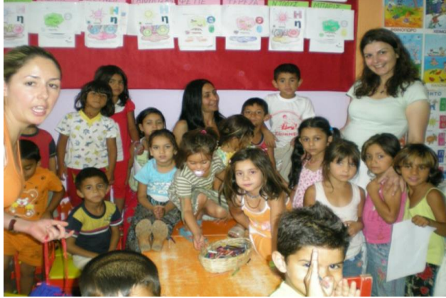
The preschoolers with their dedicated teachers.

September 2016-September 2017 Operating preschool center for children 3-5 years old: The Stavros Niarchos Foundation funds Elpida for the operation of its preschool. A group of teachers, mediators and social workers take on the education of toddlers. The program focuses on establishing a school routine, classroom rules, hygiene lessons and Greek language for children. The program also includes many art activities (crafts, painting, construction) and on the part of the social workers, psychosocial observation of the children, informing parents about their progress and research of children's family environment. The mediators play an important role, providing translation for better communication between teachers and children, preparing meals, cleaning the space and helping the teachers. http://www.snf.org/el/