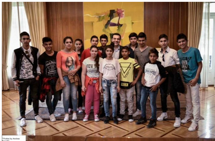
A group of young Elpida participants visiting with Prime Minister Alexis Tsipras.

-23-4-2016: The students of the 8 th secondary school of Xanthi, in the context of their educational trip to Athens, visited the Greek Parliament and with the mediation of Elpida visited the Prime Minister's residence. The students had the chance to talk with Prime Minister Alexis Tsipras in a cordial atmosphere and present their settlement's problems.