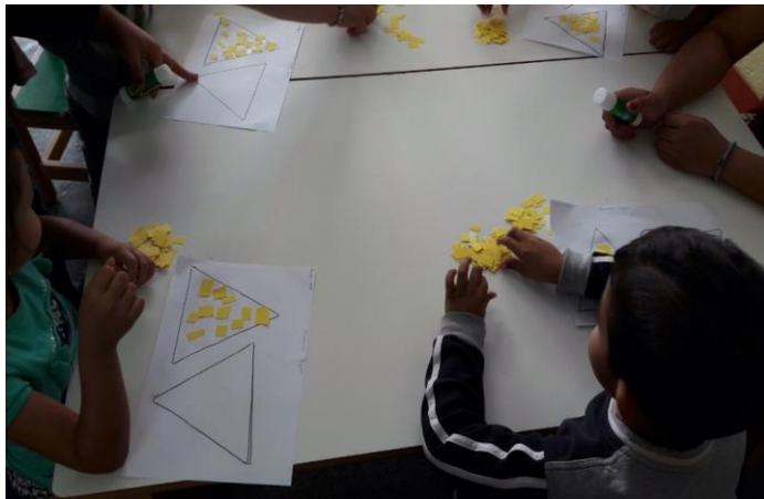
Art activities foster crucial preschool skills.