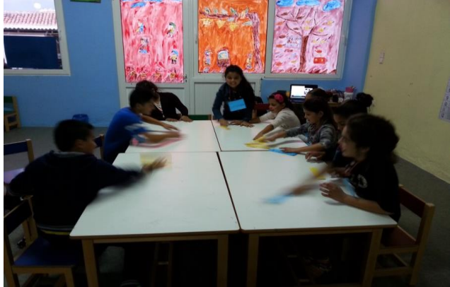
Getting ready to paint.