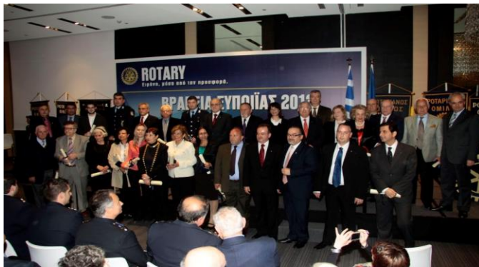
Awards ceremony, Rotary Clubs of Thessaloniki, 2013.