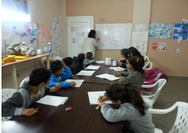
Tutoring session at the Elpida centre.