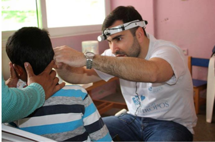
Medical examinations at the center, thanks to volunteers from Mission Anthropos.