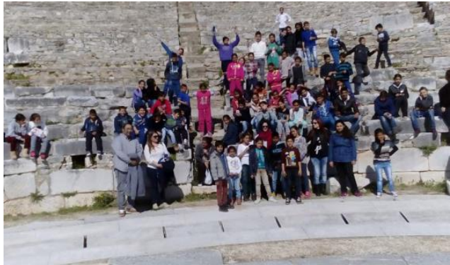
Excursion with the children to the ancient theatre of Philippi.