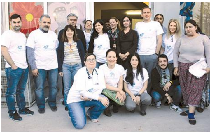
The Mission Anthropos team with the Elpida crew.