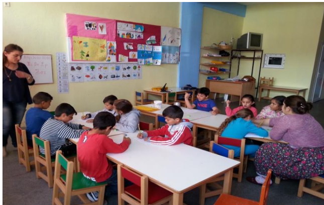
Helping children of the community to master Greek, a key to school success.