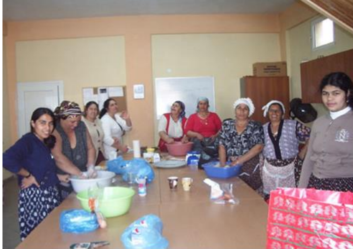
Women from the community receive vocational training.