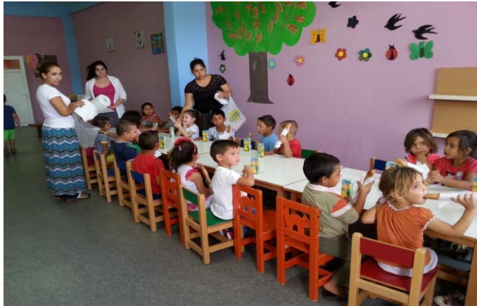
The preschoolers with their teacher and volunteer aides from the community.